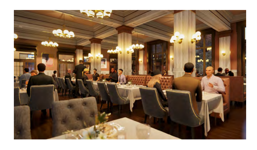
20 W. Tabb St., Petersburg